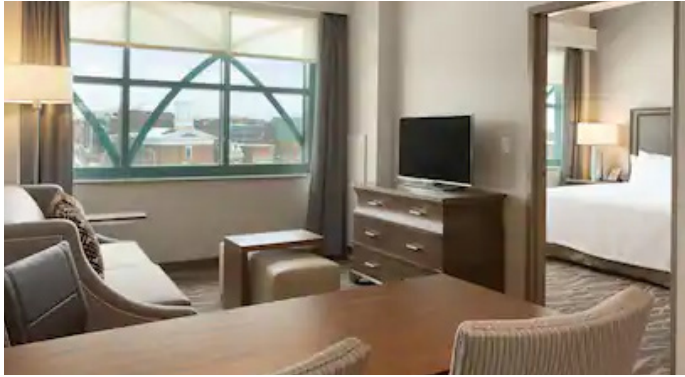
Embassy Suites by Hilton Saratoga Springs