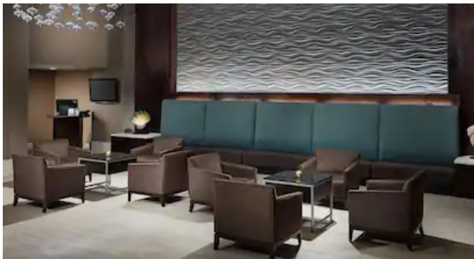
Embassy Suites by Hilton Orlando Lake Buena Vista Resort