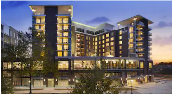
Embassy Suites by Hilton Greenville Downtown Riverplace