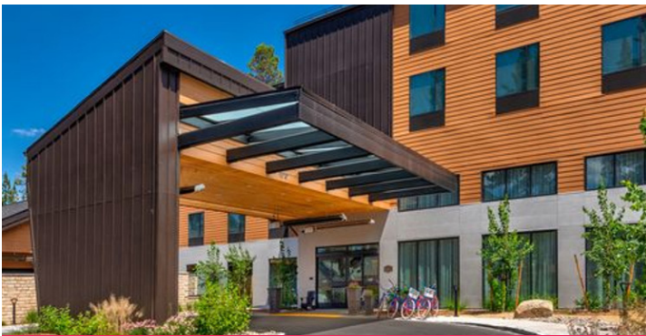
Hampton Inn & Suites South Lake Tahoe