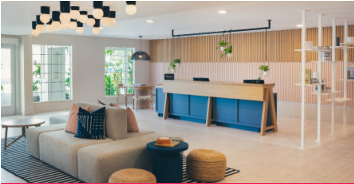
Hampton by Hilton Grand Cayman Seven Mile Beach