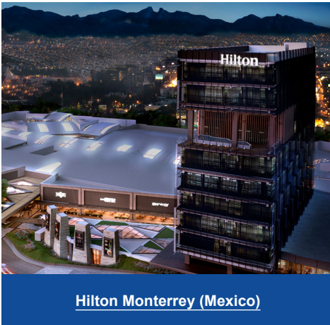
Hilton Monterrey (Mexico)