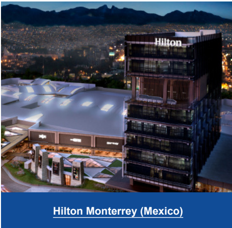
Hilton Monterrey (Mexico)