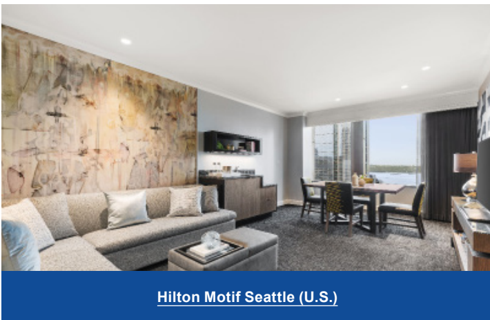
Hilton Motif Seattle (U.S.)