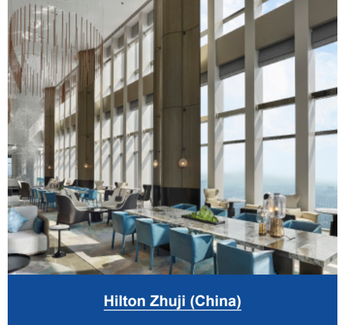
Hilton Zhuji (China)