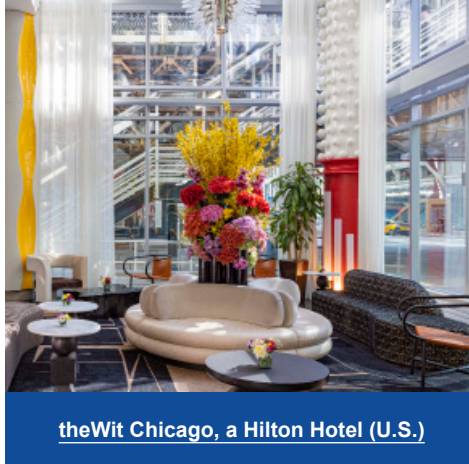
theWit Chicago, a Hilton Hotel (U.S.)